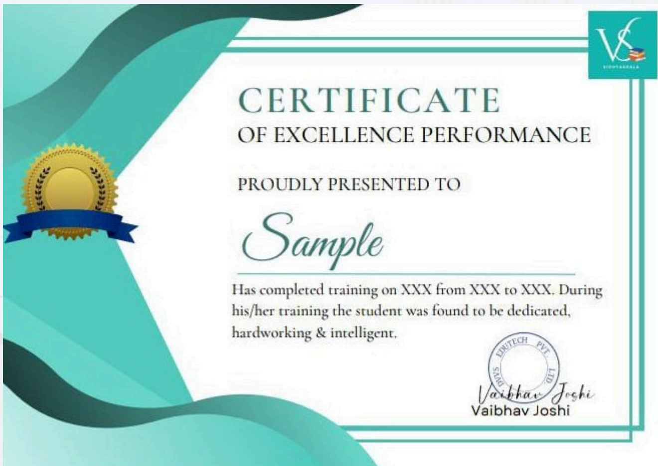
Certificate Of Excellence