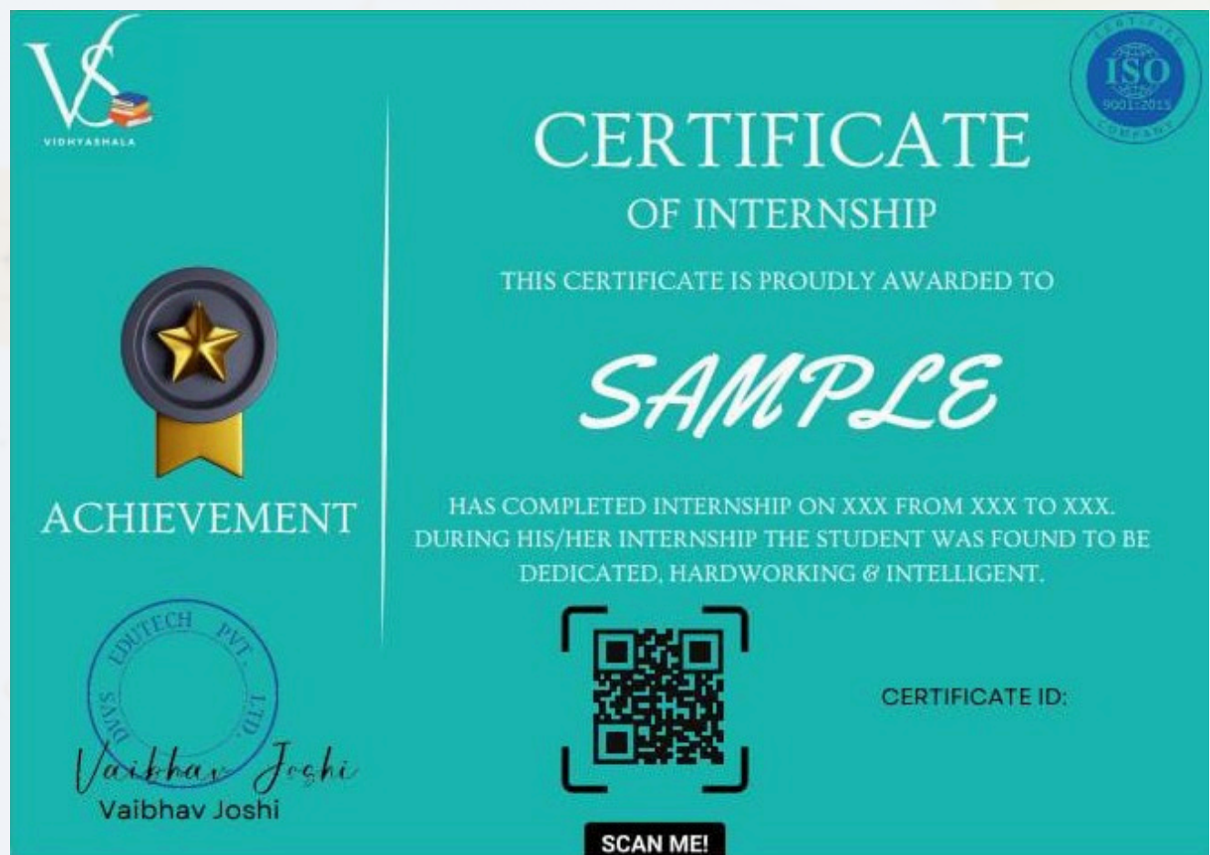
Internship Completion Certificate